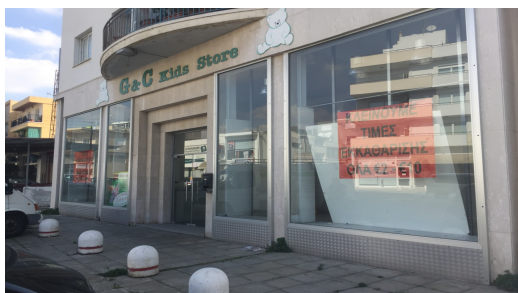
GROUND FLOOR MEZANNINE