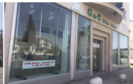
91 SQM 41 SQM